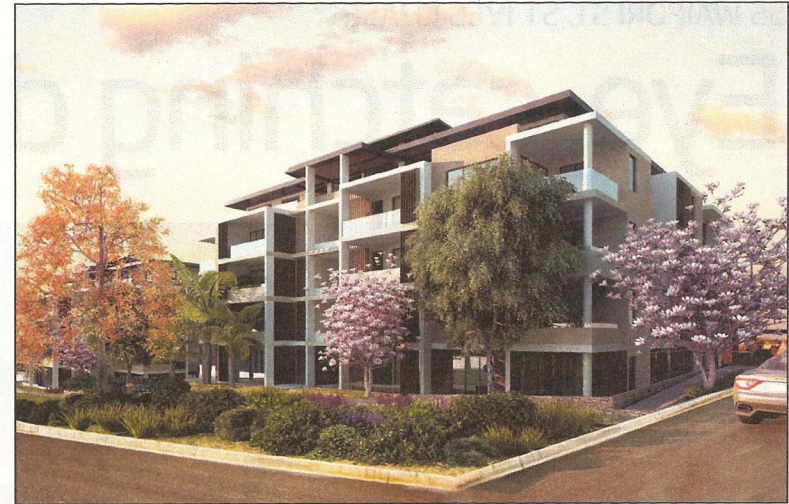
A computer generated image of the Longton Group's Uptown in Roseville.

Roseville is a leafy, family-friendly suburb on the train line with good access to both Chatswood and the city. It has a village-style atmosphere and proximity to a selection of well-regarded schools.